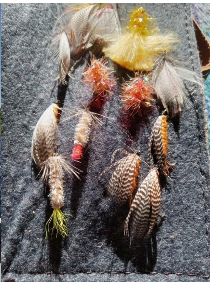
Mac's day on the Penobscot